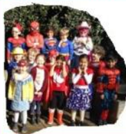
Red Nose Day

Below is a little look into our Spring Term at Jordans School this year: