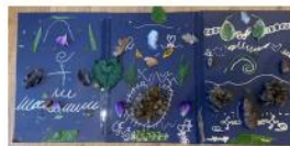
Five Ways to Wellbeing