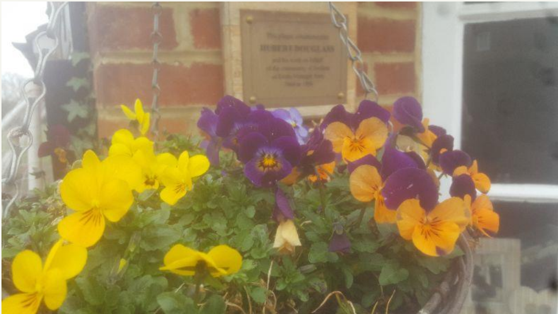
Above: The hanging baskets and floral displays outside the Estate office are in full bloom