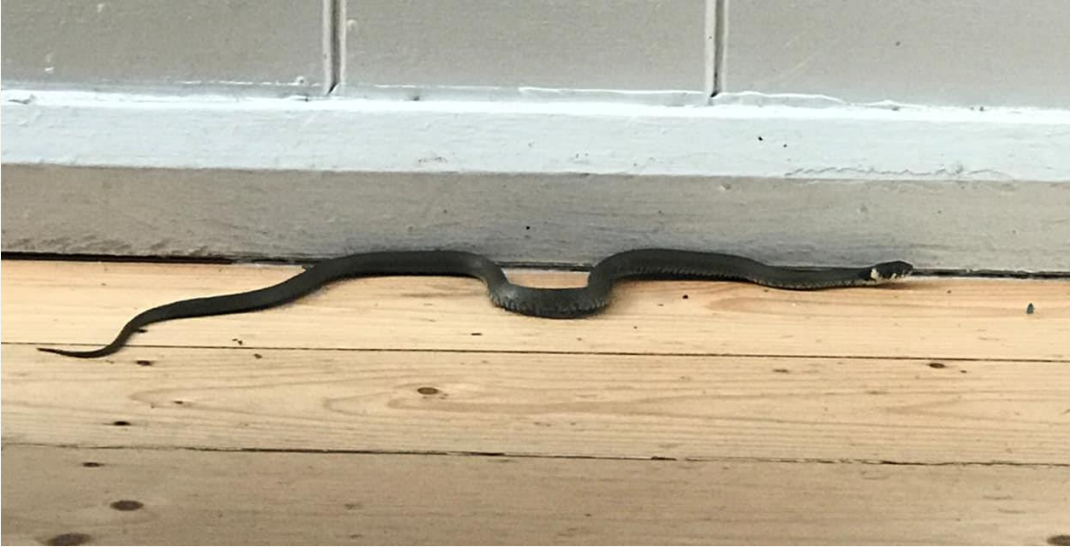
Above: Another grass snake!