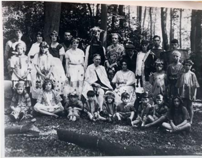
Midsummer Night's Dream, performed in the dell in Crutches wood, 1923