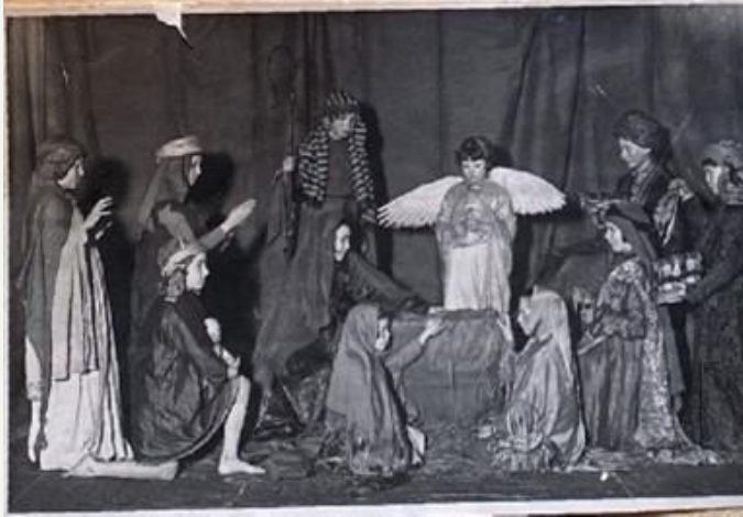
Gift Service Tableau in the Hall, 1934