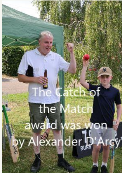
Above & Below: Jordans Village's annual cricket match took place on 28th July and was another thoroughly enjoyable day of cricket in the sunshine!